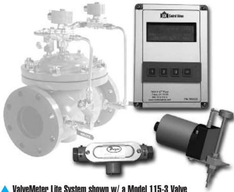
▲ ValveMeter Lite System shown w/ a Model 115-3 Valve

The ValveMeter Lite (VML) is an electronic flow measurement system that can be added to any OCV control valve, ranging from 4" to 24". By adding this system, the electronic unit will give the ability to measure flow through the adapted valve.