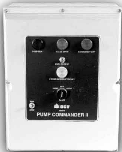
▲ Pump Commander II shown

The OCV Pump Commanders are factory wired control panels that interface with any of the OCV Series 125/126 Pump Control Valves. All models are easily installed and minimize wiring between the pump control valve and pump. Each model provides the basic commands for starting/stopping of the pump and for opening/closing the pump control valve. Varying degrees of pump protection and visual indication of system status are available, with the level of sophistication dependent upon the model used.